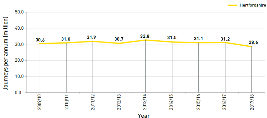
Figure 2 Passenger journeys on Hertfordshire bus services

national rate of 8.2% and it has since fallen further to 2.5%. In absolute terms, the local bus journeys in Hertfordshire are pretty much flat lined as shown in the following graph.