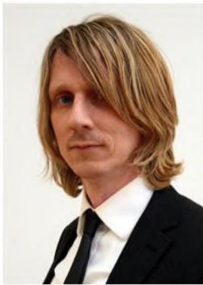
Portfolio Holder for Climate Change

This plan will be refreshed every 3 years and reviewed annually. Progress against targets will be reviewed twice a year.